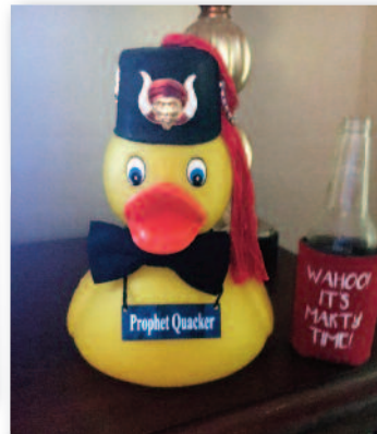
P.Q. is having a toast to the new Grand Monarch Marty.